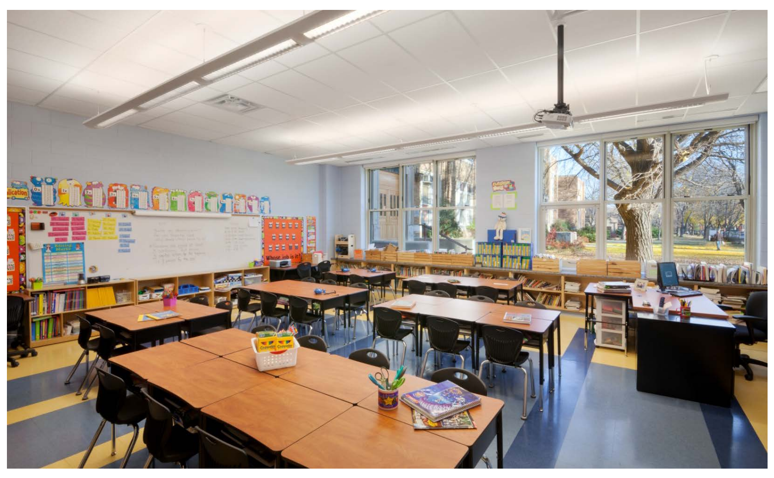
Classroom at Sauganash Elementary School Addition

Arthur E. Canty Elementary School Annex A Fine & Performing Arts School