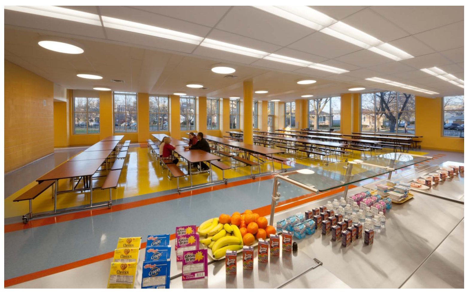
Kitchen and Dining Facilities at Sauganash Elementary School Addition

Arthur E. Canty Elementary School Annex A Fine & Performing Arts School