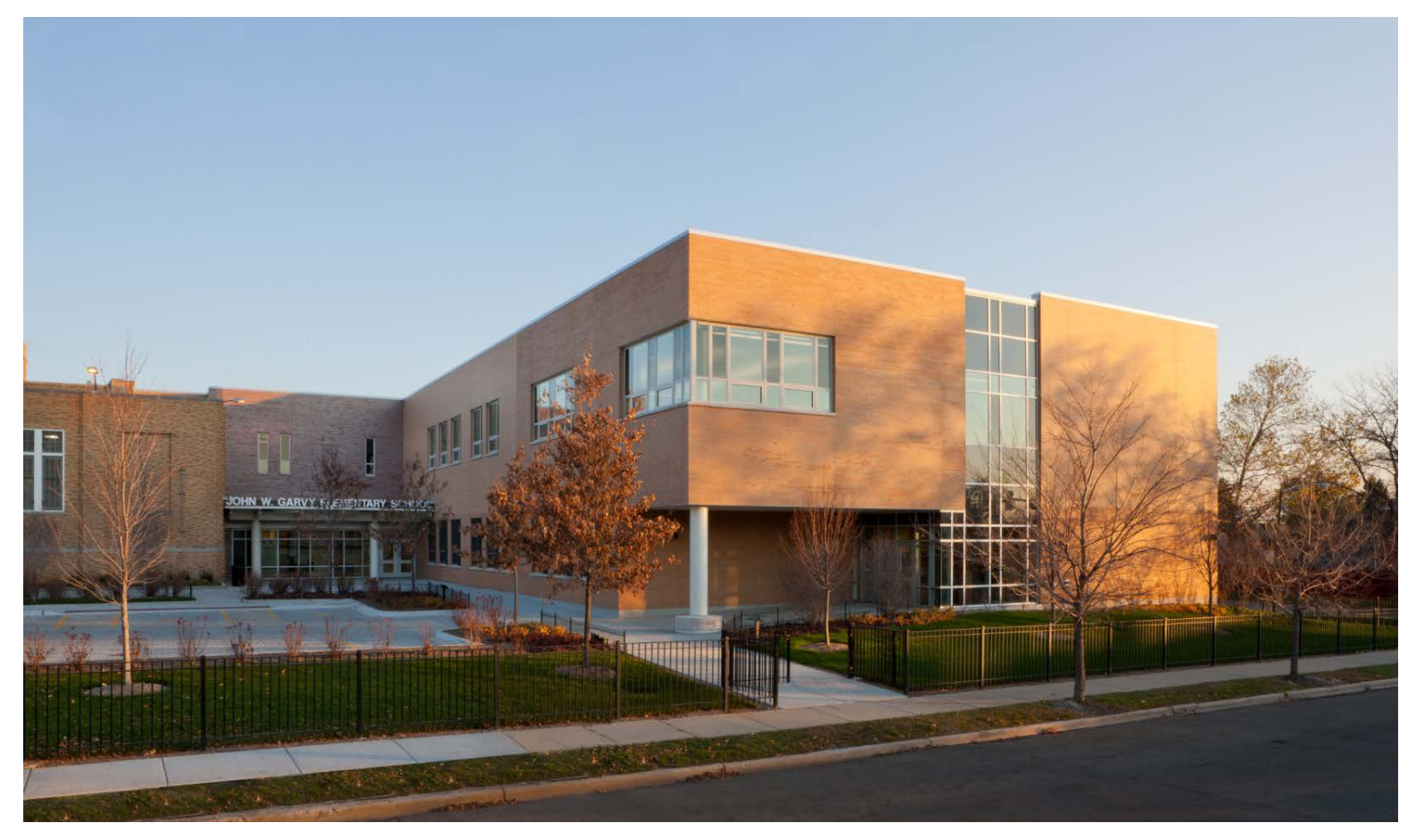
Garvy Elementary School Addition

Arthur E. Canty Elementary School Annex A Fine & Performing Arts School