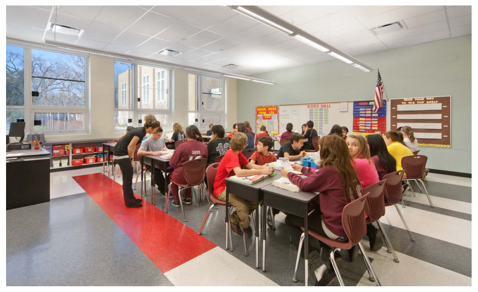
Classroom at Garvy Elementary School Addition

Arthur E. Canty Elementary School Annex A Fine & Performing Arts School