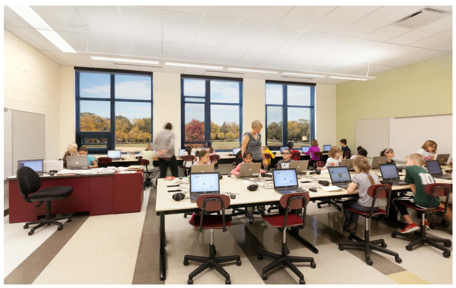
Computer Lab at Edgebrook Elementary School Addition

Arthur E. Canty Elementary School Annex A Fine & Performing Arts School